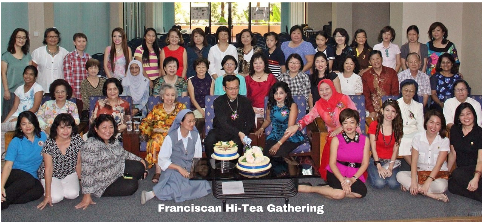
Franciscan Hi-Tea Gathering

* Science Laboratories for RM88k (Fully subscribed)